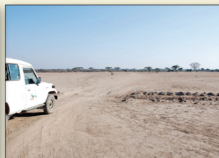
Roads in Mbarali District