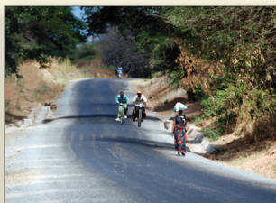
Transport by bike or by feet in Mbarali District