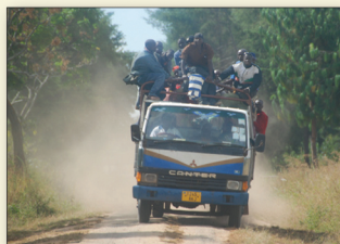
Transport in Mbozi District

In this case the village can access the dispensary at 5 km. Kijiji kipo umbali wa kilomita 5 kufikia zahanati.